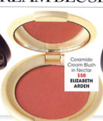
Ceramide Cream Blush in Nectar $50 ELIZABETH ARDEN