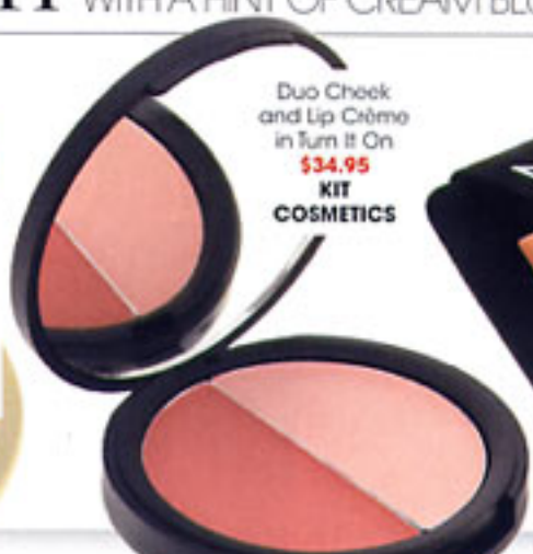
Duo Cheek and Lip Crème in Turn It On $34.95 KIT COSMETICS