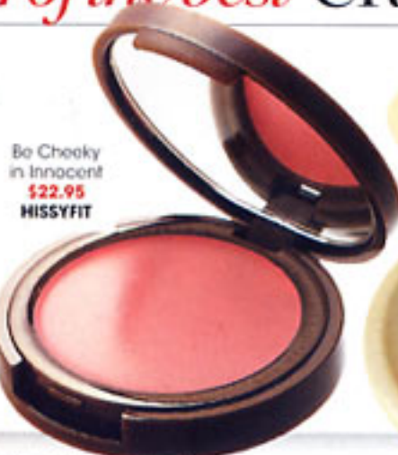
Be Cheeky in Innocent $22.95 HISSYFIT

FAKE THAT 'I'VE JUST FINISHED A HUGE WORKOUT' FLUSH WITH A HINT OF CREAM BLUSH SMOOTHED OVER CHEEKS