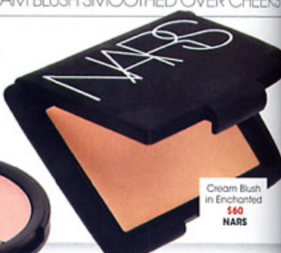
Cream Blush in Enchanted $60 NARS