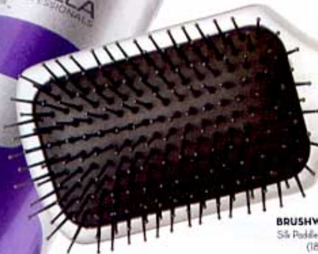
BRUSHWORX Keratin Silk Paddle Brush, $2195 (1800 251 215)

Add a cute curl at the front à la Gwen by twisting a piece of hair around your finger, adding mousse and pinning upwards to hold.