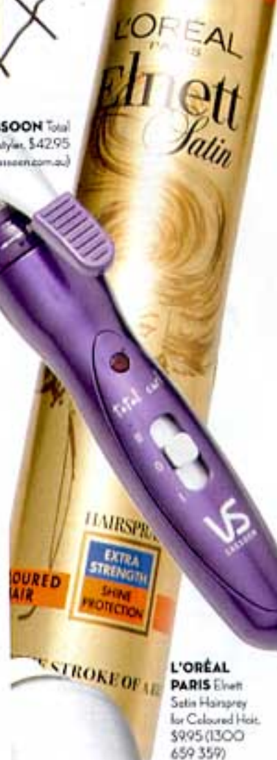
L'ORÉAL PARIS Elnett Satin Hairspray for Coloured Hair, $995 (1300 659 359)