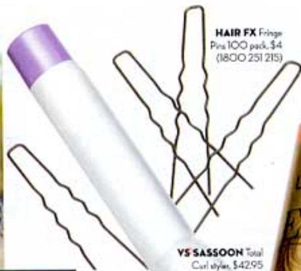
HAIR FX Fringe Pins 100 pack, $4 (1800 251 215)