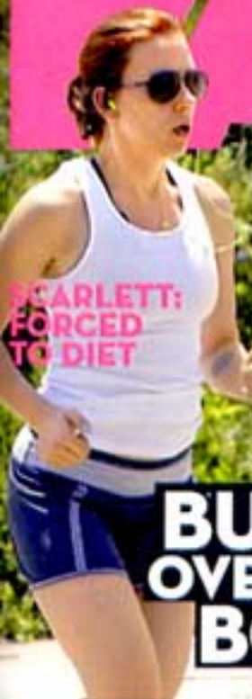
SCARLETT: FORCED TO DIET