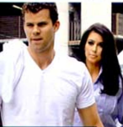
'YOU'RE TOO GOOD FOR HER!' KIM'S OUTRAGE AS KRIS' FAMILY TURN THEIR BACK ON HER