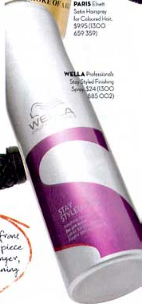
WELLA Professionals Stay Styled Finishing Spray, $24 (1300 885 002)

Add a cute curl at the front à la Gwen by twisting a piece of hair around your finger, adding mousse and pinning upwards to hold.