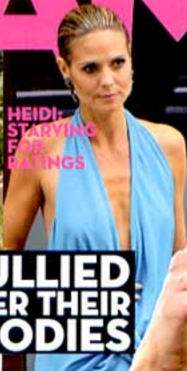
HEIDI: STARVING FOR RATINGS