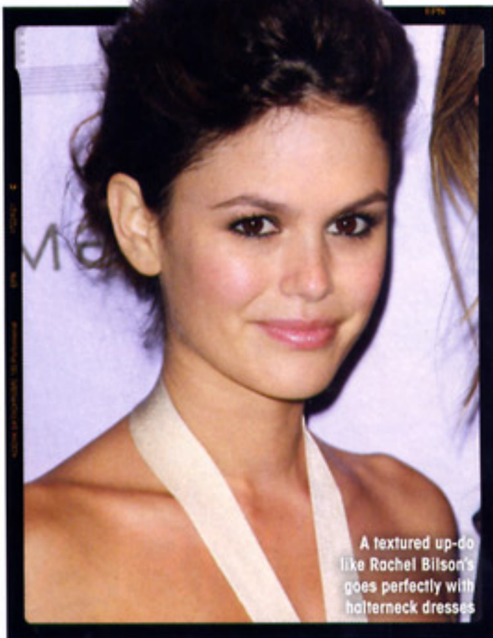
A textured up-do like Rachel Bilson's goes perfectly with halterneck dresses