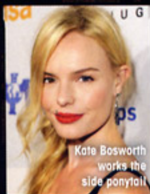
Kate Bosworth works the side ponytail